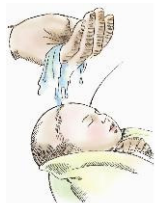
Baptized In The Name of the Lord