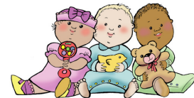
Births in the Church Family