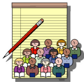
M embership Class

Wednesday Morning Bible Study will resumed at 10am on September 7 th .